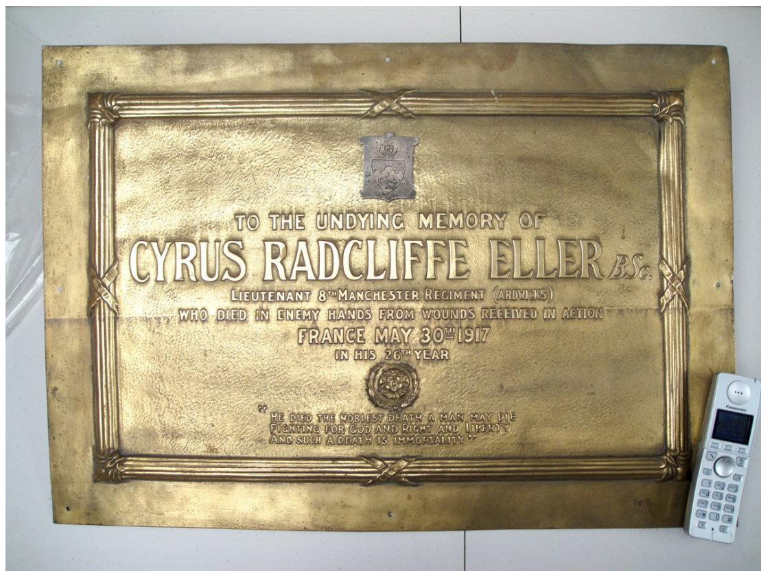
Dukinfield Moravian Church Memorial